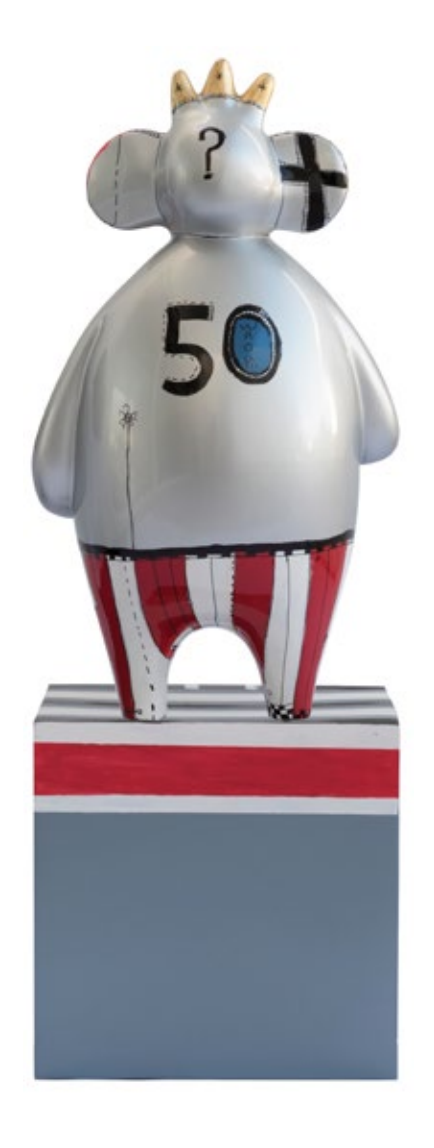
ELEPHANT, 2017 1/1 Resin 90 x 50 x 40 cm