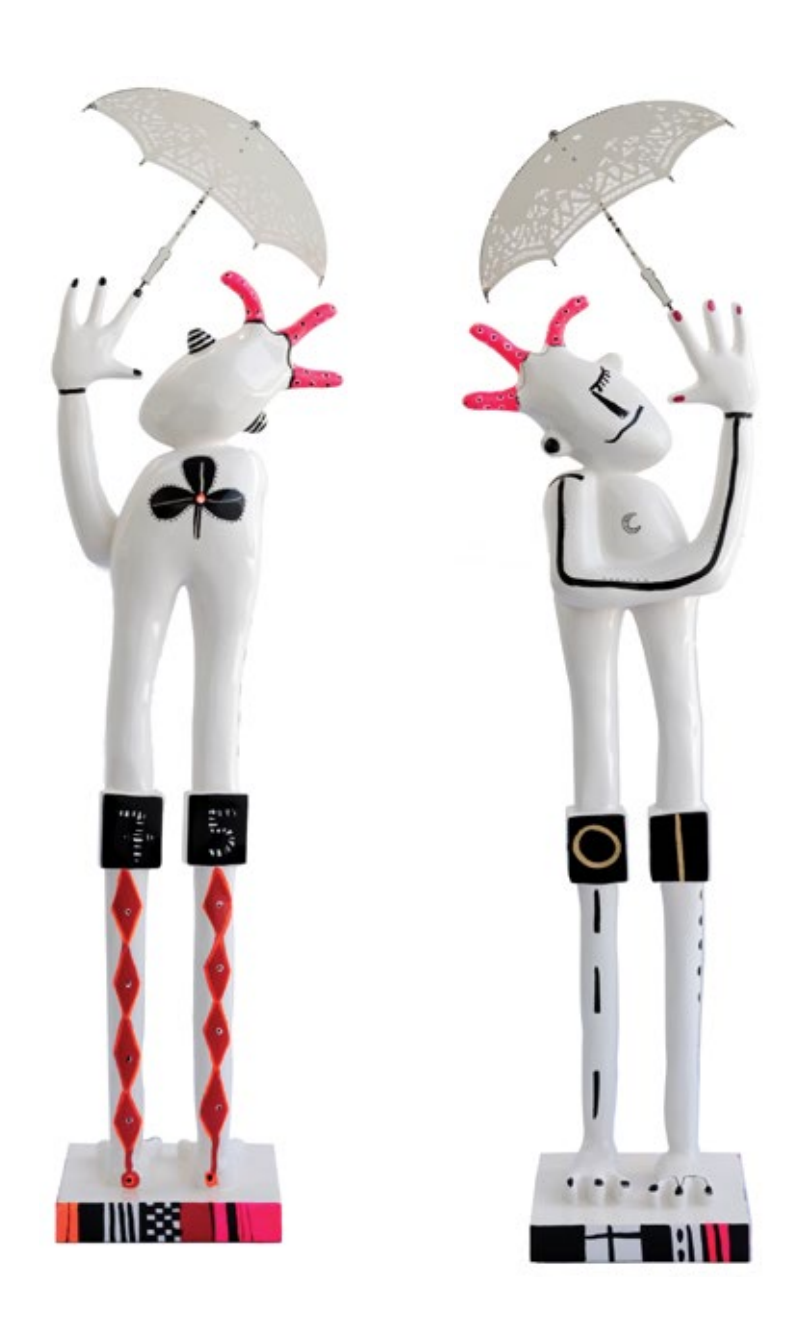
THE MAN WITH UMBRELLA, 2016 1/1 Resin 178 x 55 x 40 cm