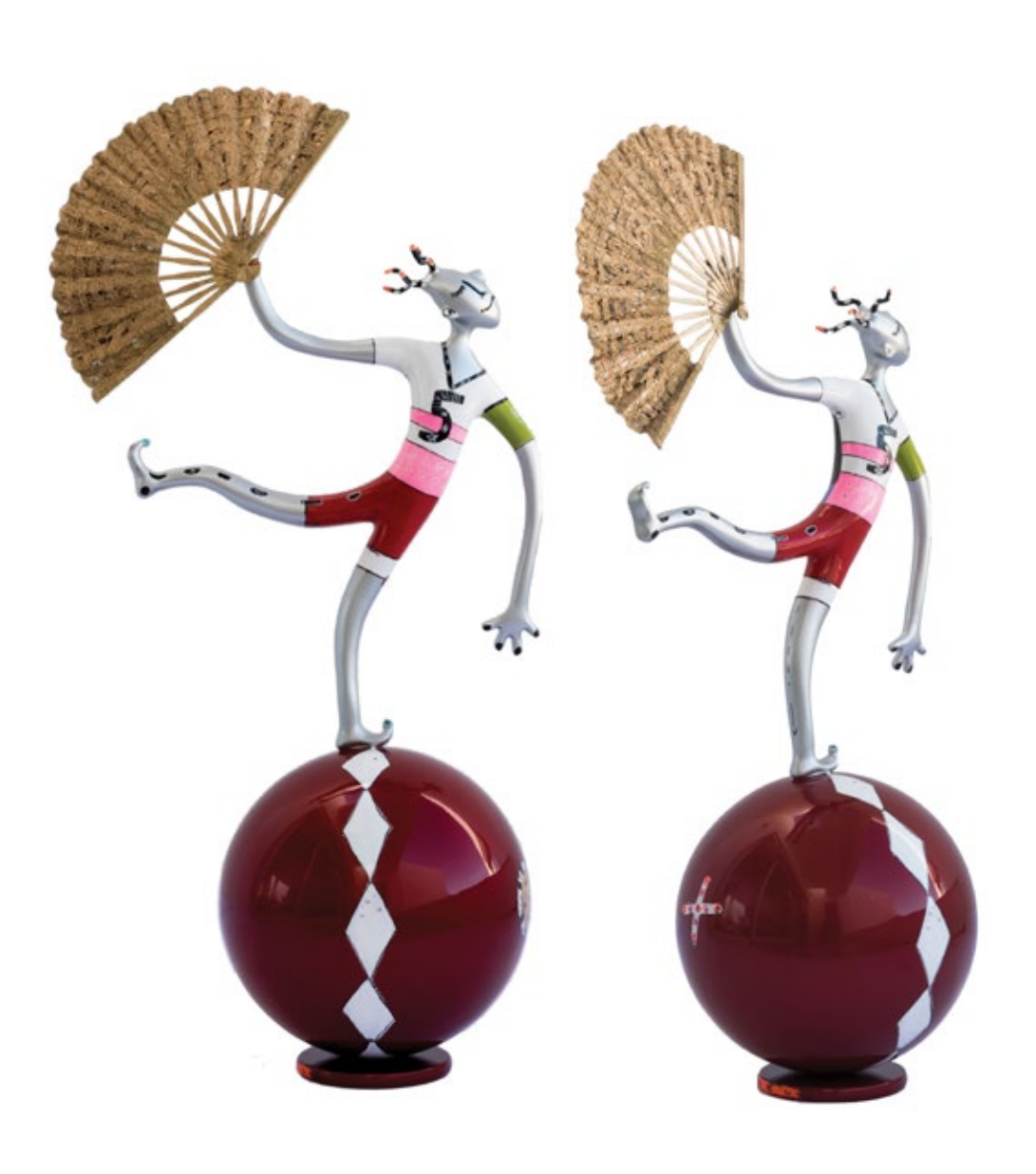
THE SPANISH, 2016 1/2 Resin 112 X 53 X 40 cm