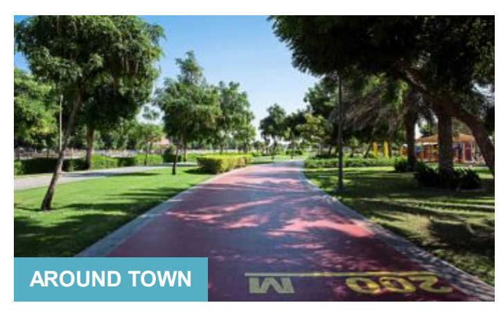
Best parks in Dubai