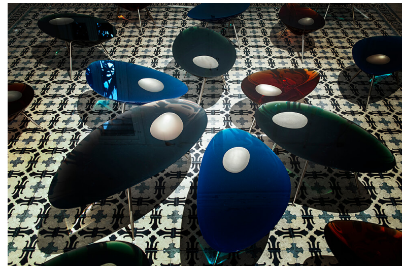
Georges Mohasseb, Avoca-Avocado, 2017.