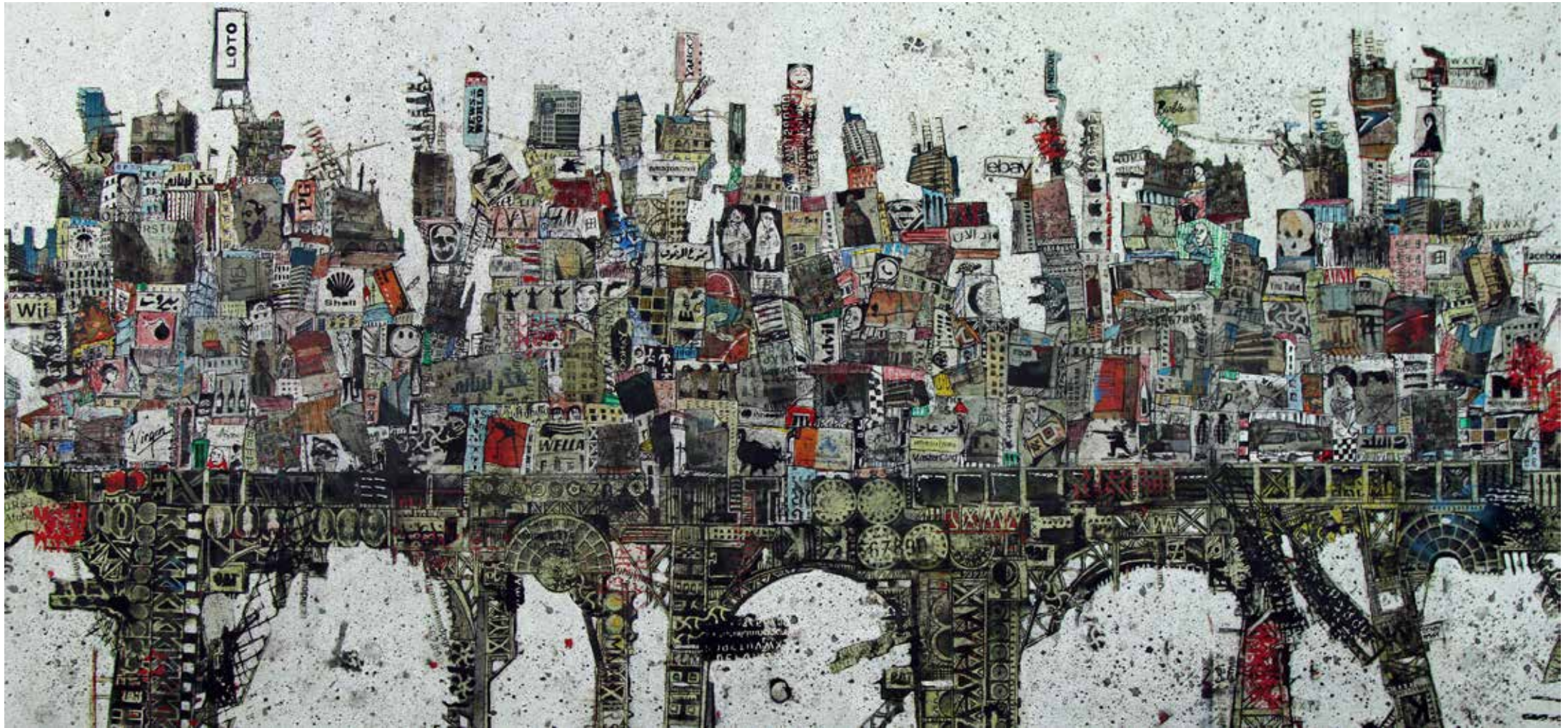
MY CITY NESTED OVER A BRIDGE 2015 Mixed Media and collage on Canvas 100 x 200 cm