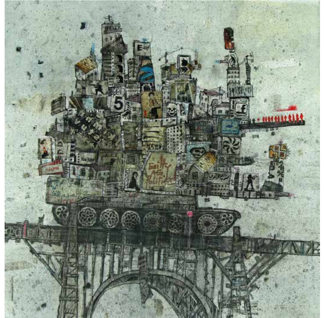
MY CITY NESTED OVER A TANK 1 2015 Mixed Media and collage on Canvas 100 x 100 cm