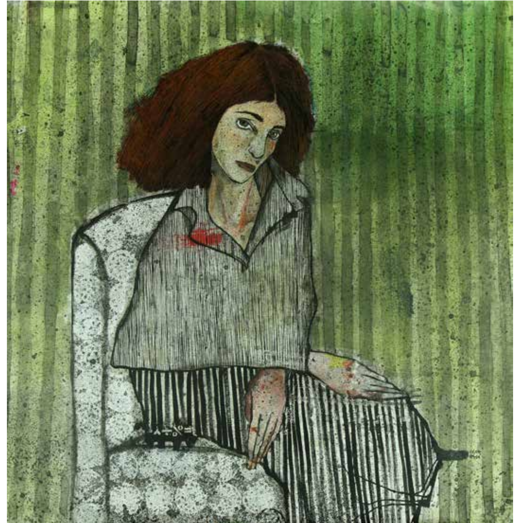
PORTRAIT IN APRIL 2015 Mixed Media on Canvas 100 x 100 cm