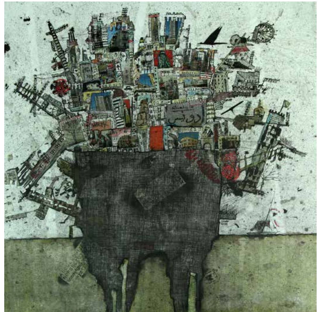
MY CITY NESTED OVER RAOUCHE 2015 Mixed Media and collage on Canvas 100 x 100 cm