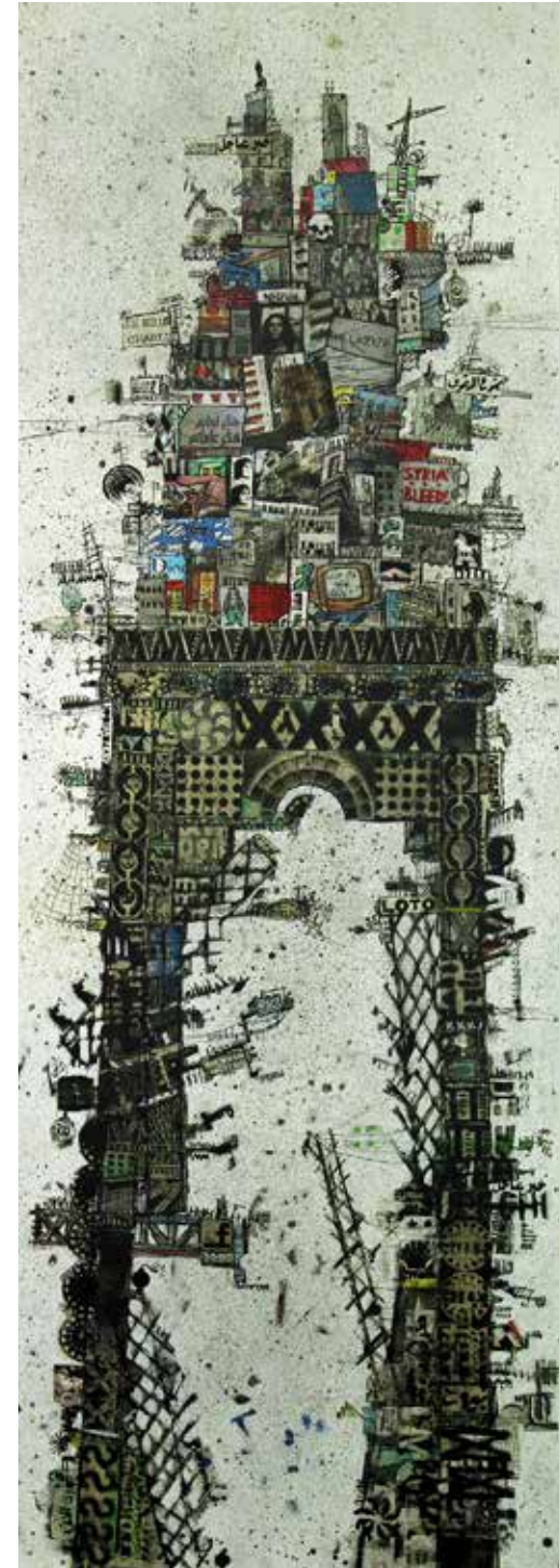
CHARLIE ON A BRIDGE 1 2015 Mixed Media and collage on Canvas 60 x 180 cm