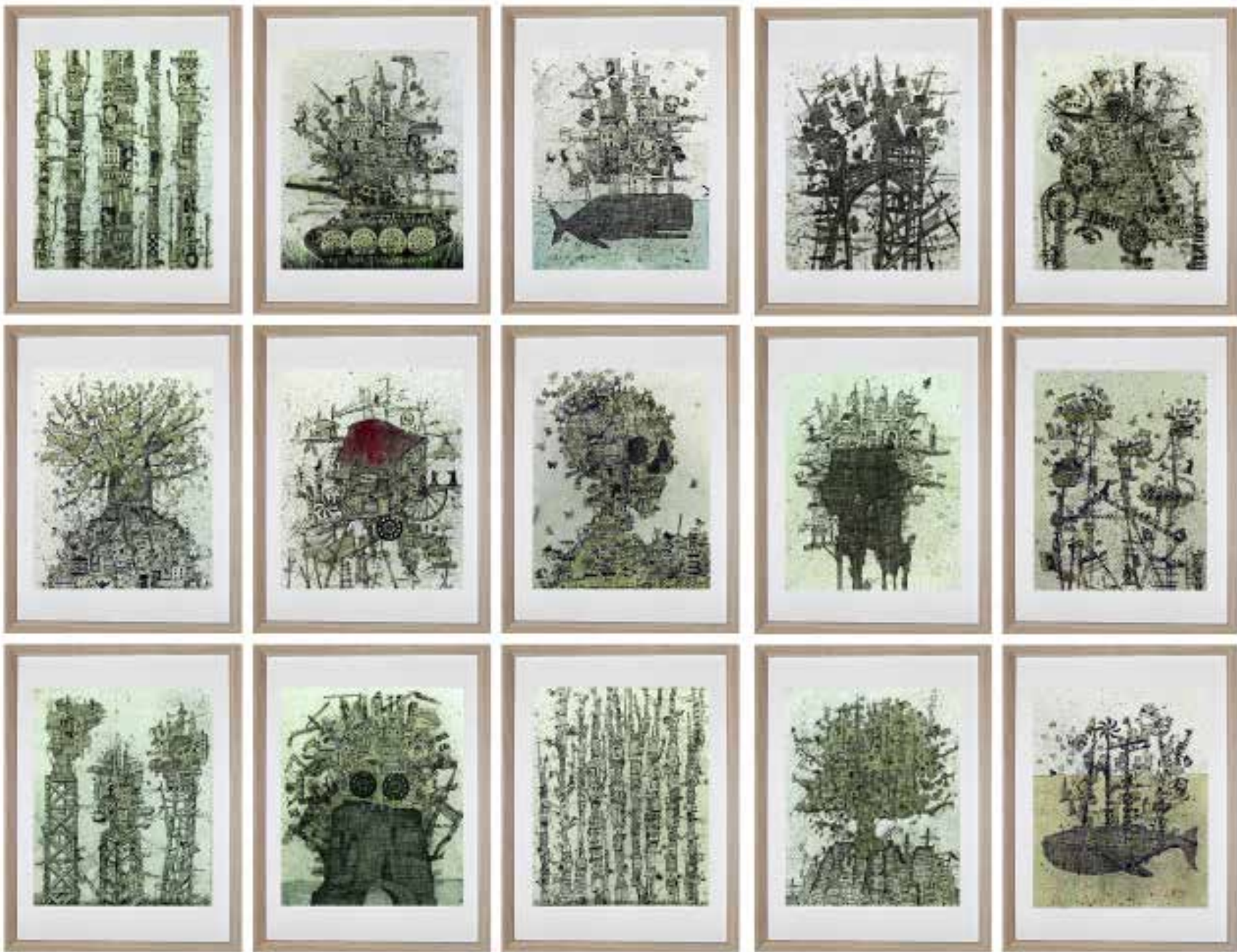
Set of small paintings 2015 Mixed Media on wood 50 x 40 cm each