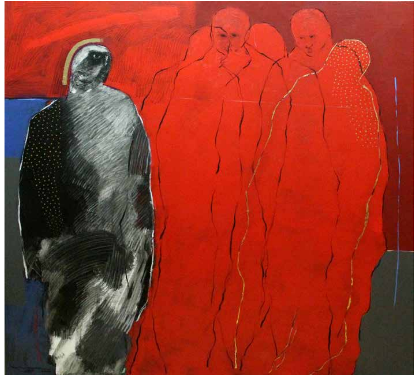
CONSPIRATORS... AND THE PERSON WITH A GOLDEN SHADE | Acrylic on canvas & Oil Pastel & Paper Gold 140 x 150 cm, 2013-2014