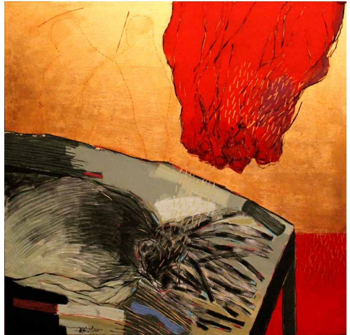
THE DEATH OF THE ROOTS | Acrylic on canvas & Oil Pastel & Paper Gold 140 x 150 cm, 2013-2014