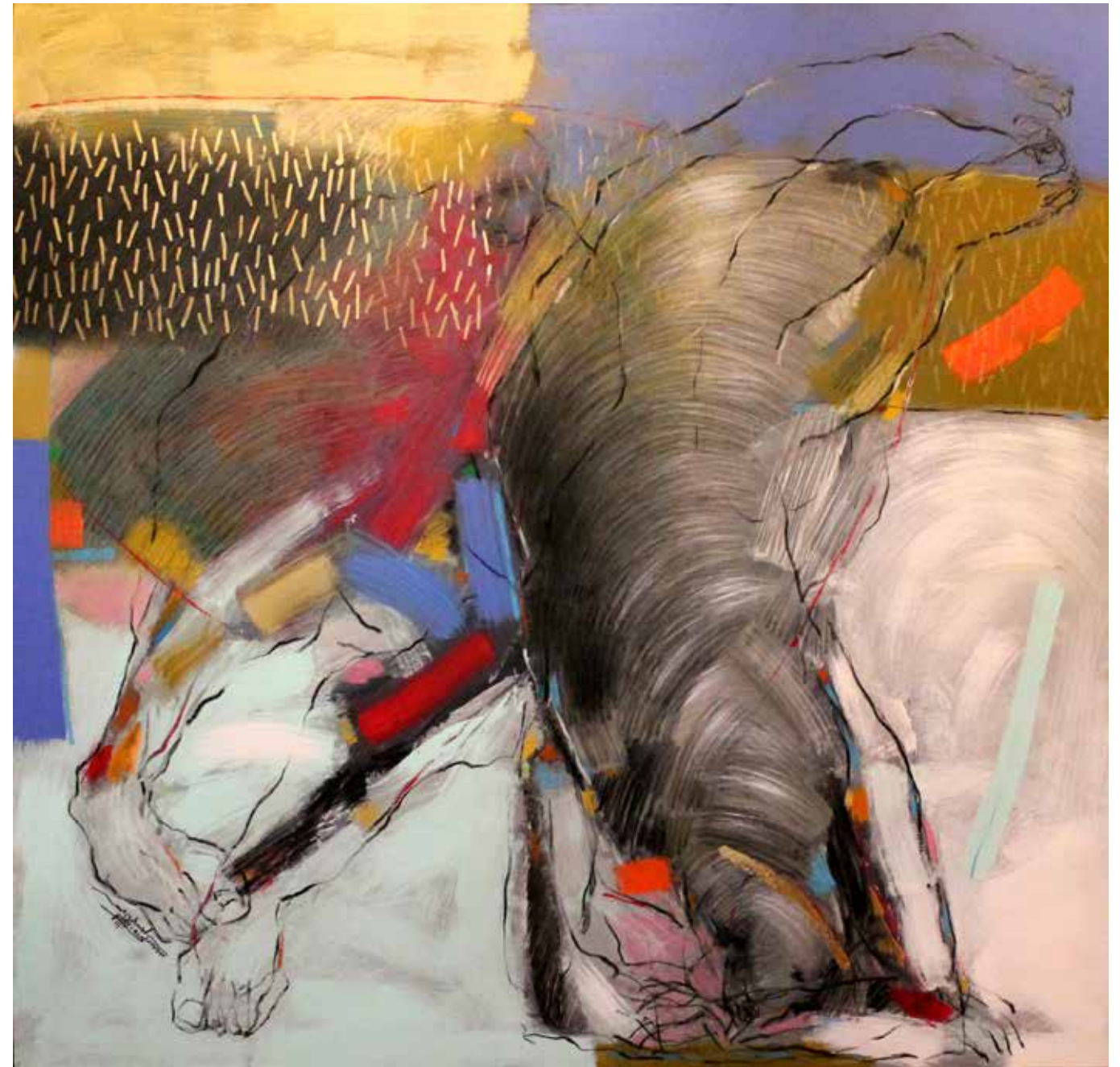
DOWNSIDE OF THE GOLDEN STAIRS | Acrylic on canvas & Oil Pastel 140 x 150 cm, 2013-2014