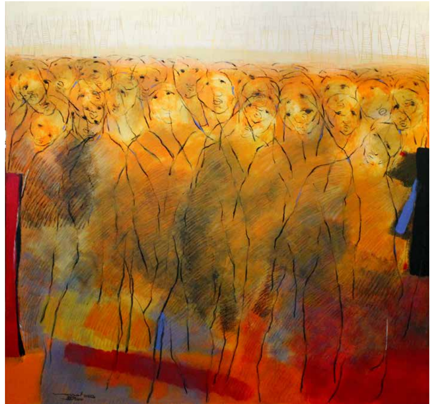
DOWNSIDE OF THE GOLDEN STAIRS | Acrylic on canvas & Oil Pastel 140 x 150 cm, 2013-2014