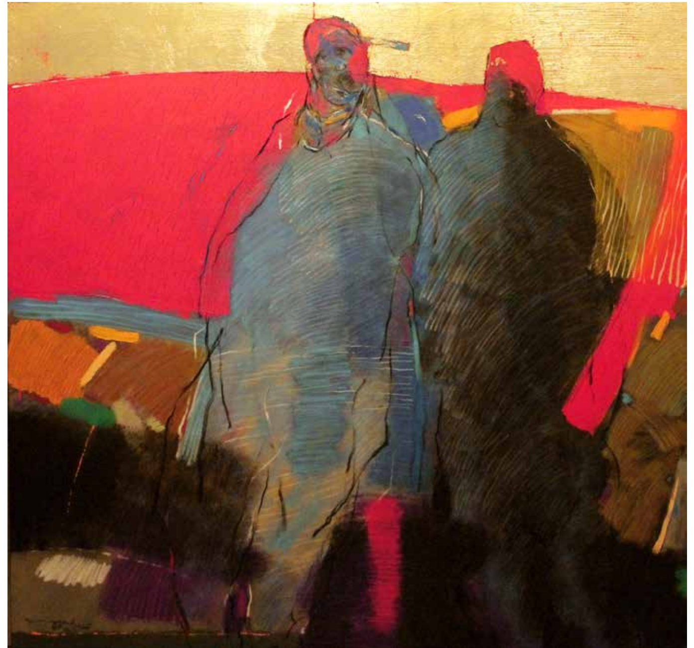
THE RED FOG | Acrylic on canvas & Oil Pastel & Paper Gold 140 x 150 cm, 2013-2014