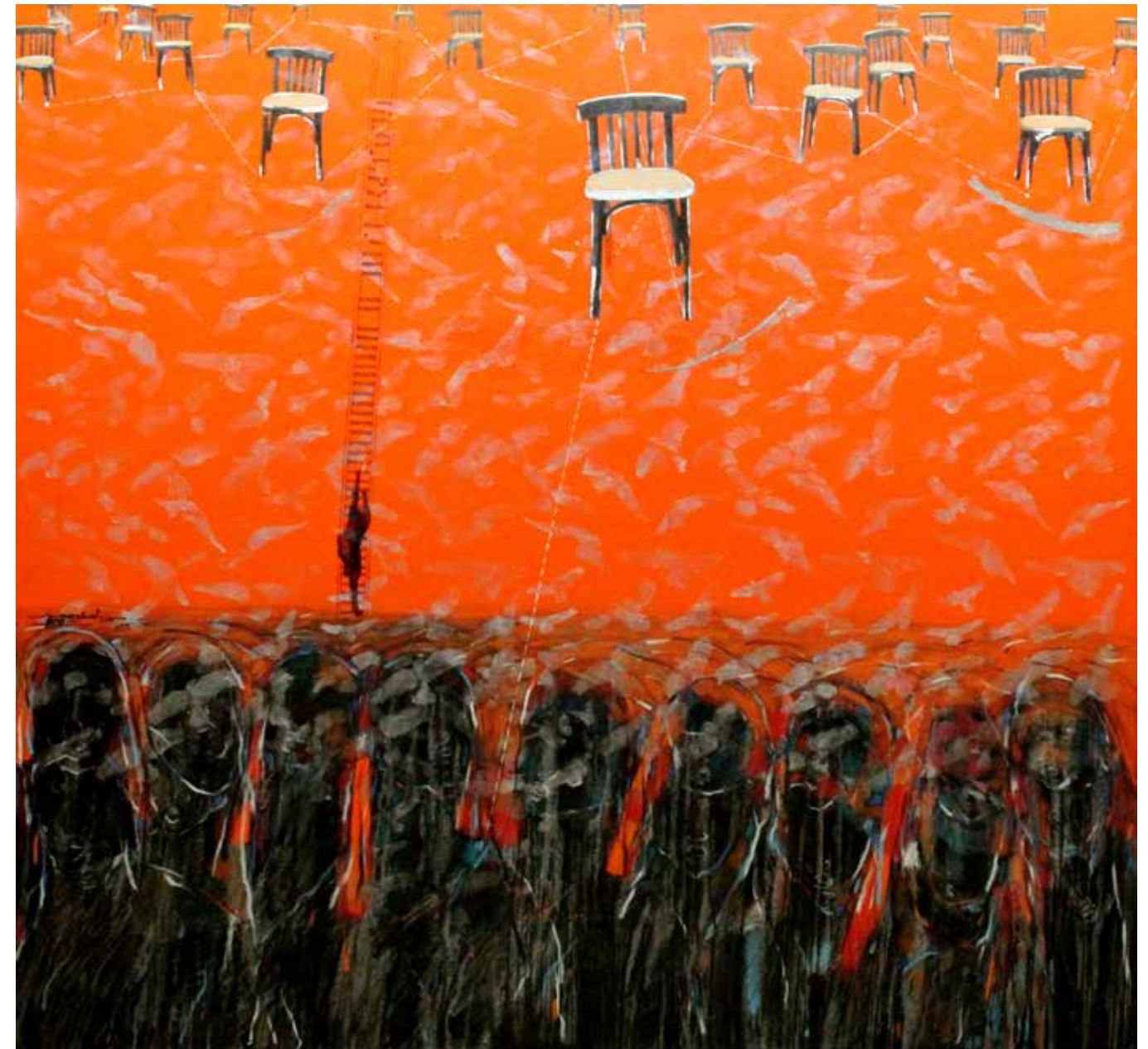
ACCESS IS IMPOSSIBLE Acrylic on canvas & Oil Pastel & Paper Silver 140 x 150 cm, 2013-2014