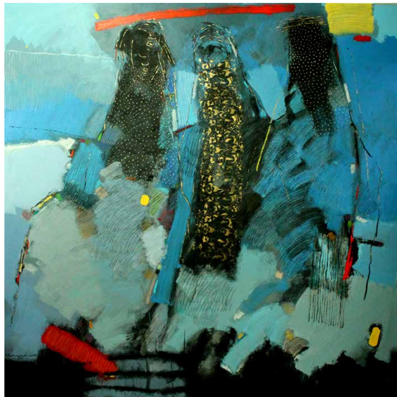
THE THREE... ONE PERSON Acrylic on canvas & Oil Pastel & Paper Gold 200 x 200 cm, 2013-2014