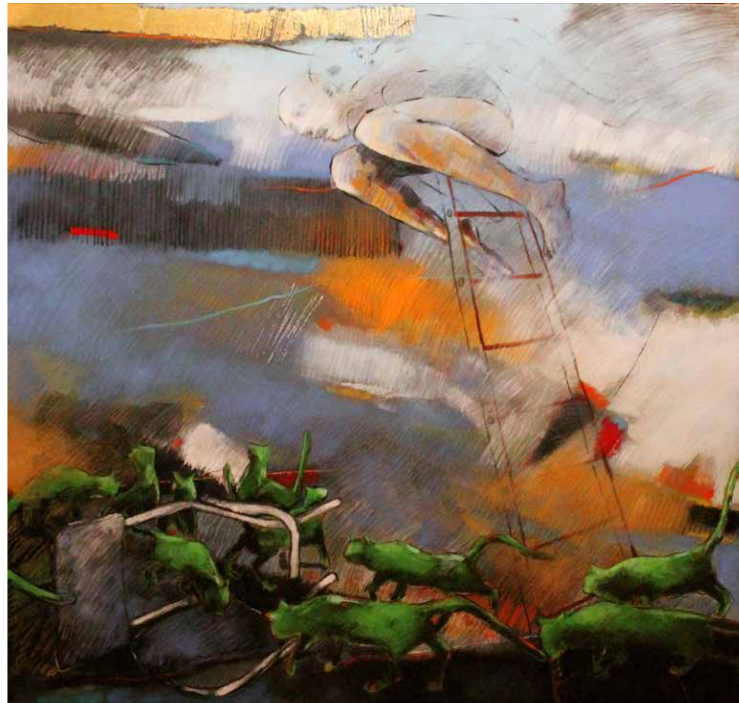
GREEN CATS ATTACK Acrylic on canvas & Oil Pastel & Paper Gold 140 x 300 cm, 2013-2014