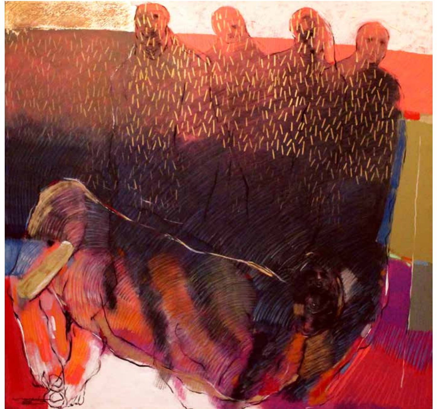
KNEELING... WORK IN PROGRESS Acrylic on canvas & Oil Pastel & Paper Gold 140 x 150 cm, 2013-2014