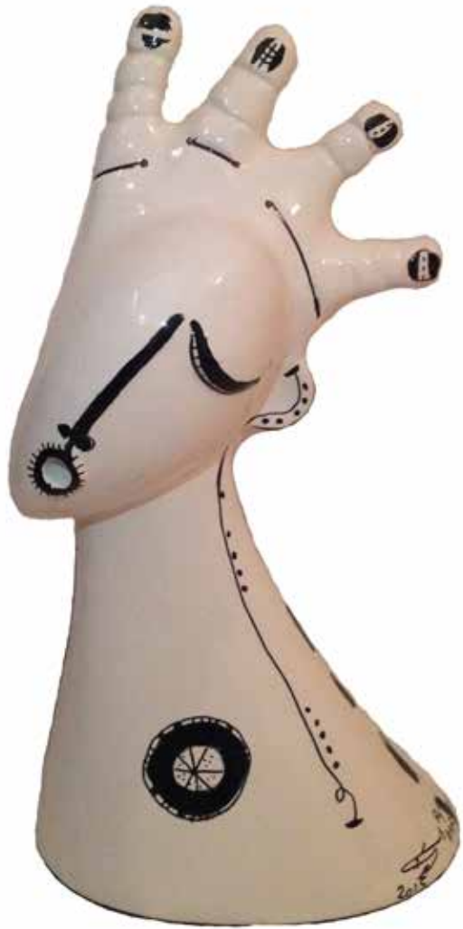
WHITE HEAD, 2015 3/3 Resine, 70 x 36 x 22 cm