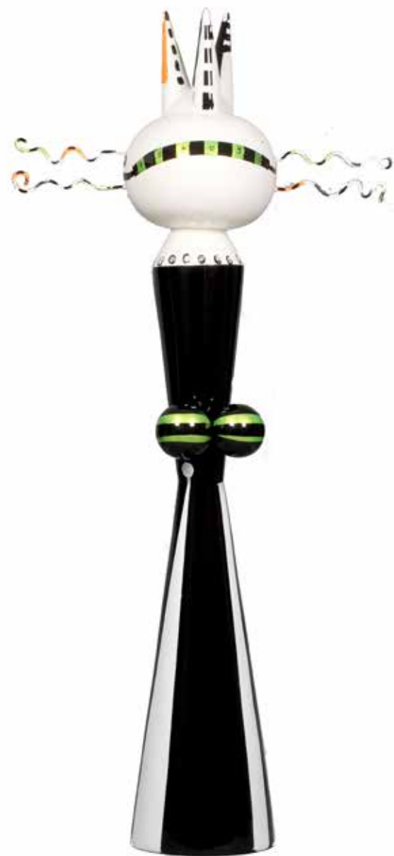
MENINAS II, 2015 1/1 Resine 110 x 45 x 20 cm