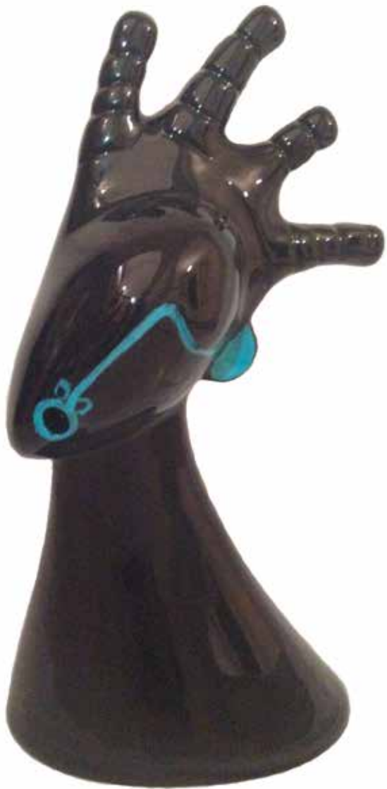
BLACK HEAD, 2015 | 1/3 Resine 70 x 36 x 22 cm