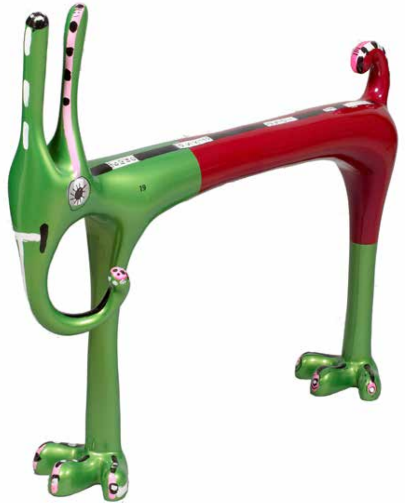
GREEN DOG, 2015, | 1/2 Resine 80 x 100 cm