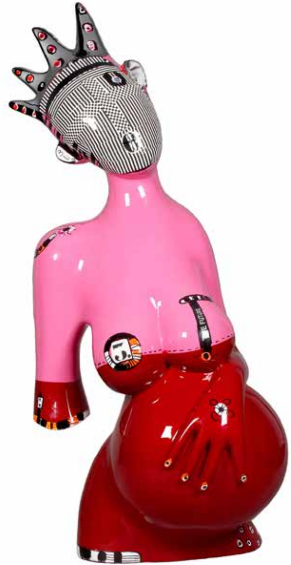
FEMME ENCEINTE I, 2015 1/2 Resine 100 x 45 x 40 cm F