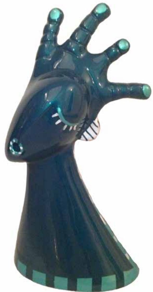
BLUE HEAD, 2015 | 2/3 Resine, 70 x 36 x 22 cm