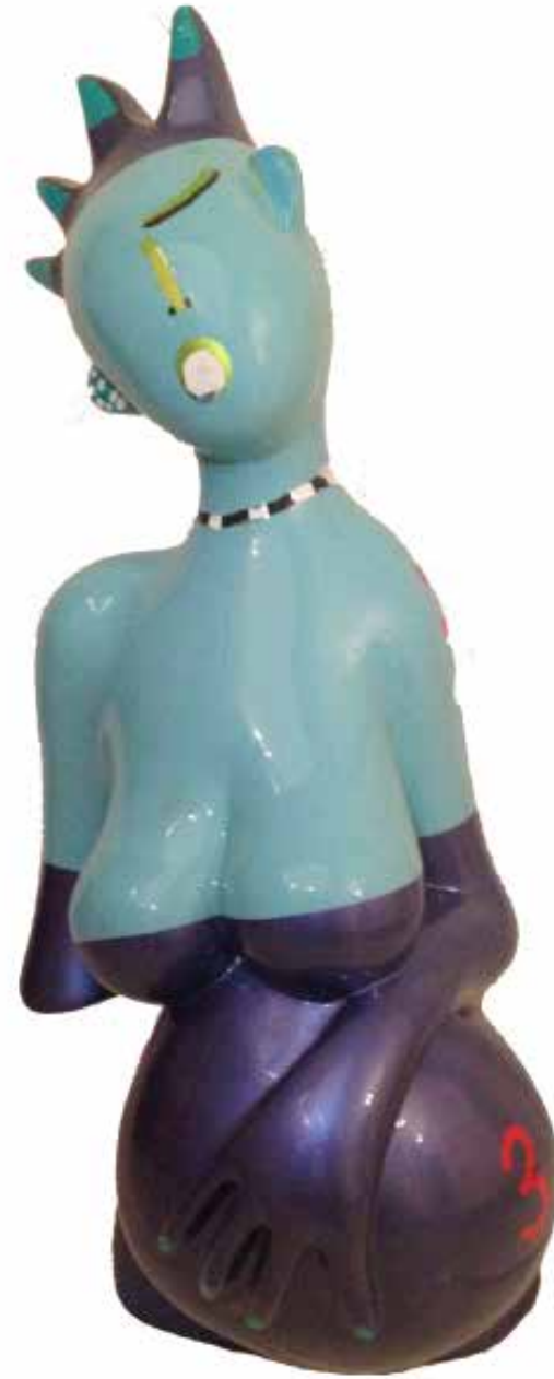
FEMME ENCEINTE II 2015 2/2 Resine 100 x 45 x 40 cm