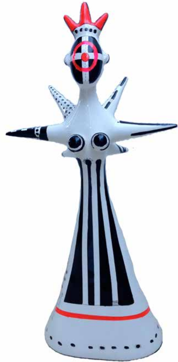
CHOUKA, 2015 1/1 Resine 160 x 60 x 55 cm