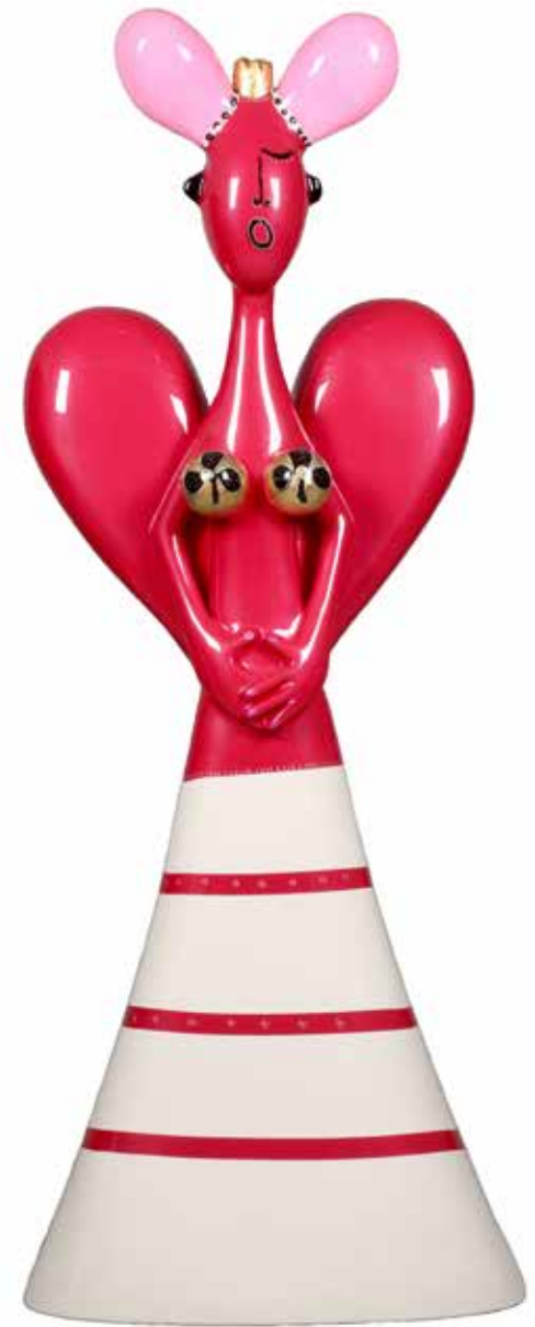
ANGEL I, 2015 1/1 Resine 152 x 60 x 35 cm