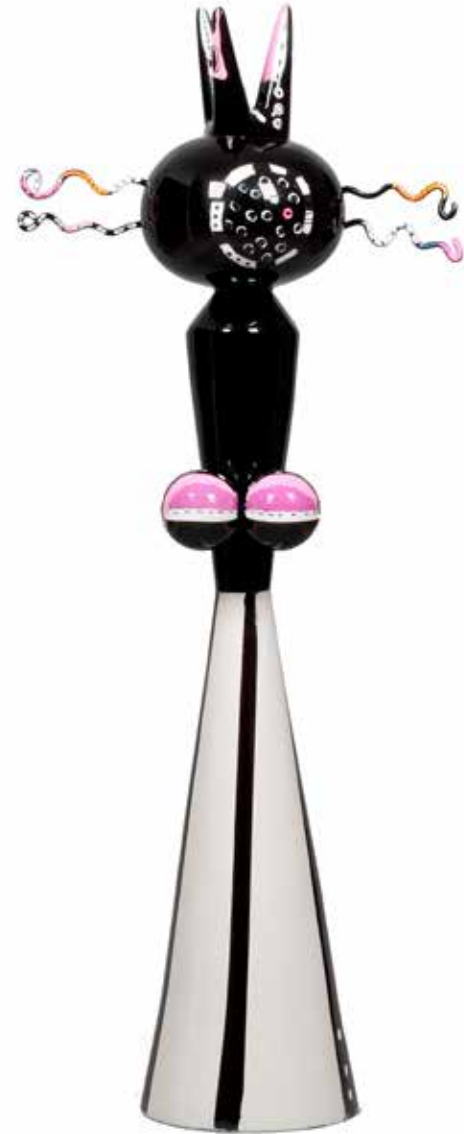
MENINAS I 2015 1/1 Resine 160 x 70 x 30 cm