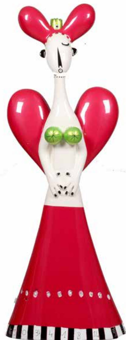
ANGEL II, 2015, 1/1 Resine 130 x 48 x 28 cm