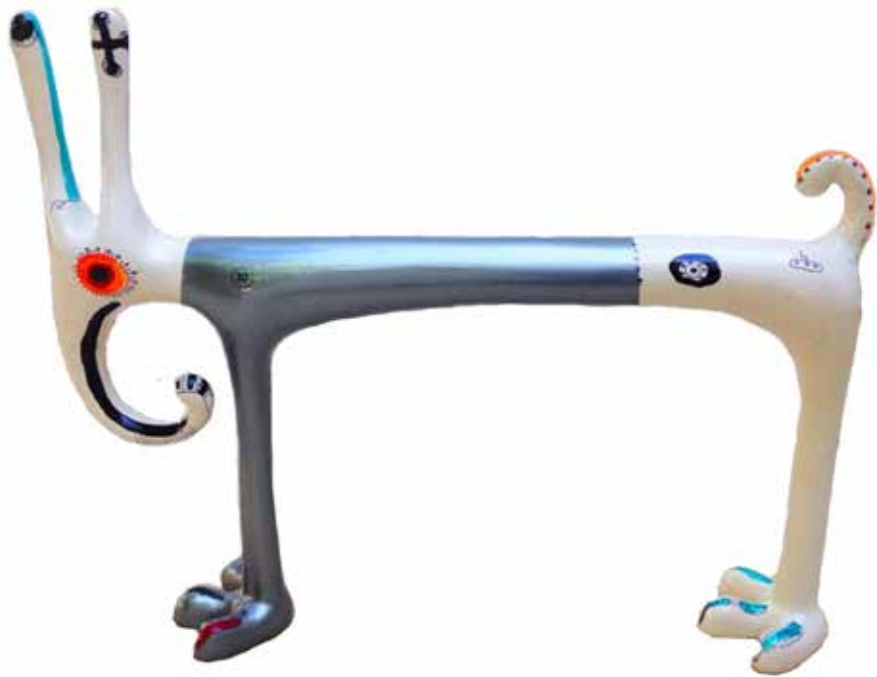
WHITE DOG, 2015 | 2/2 Resine 80 x 100 cm