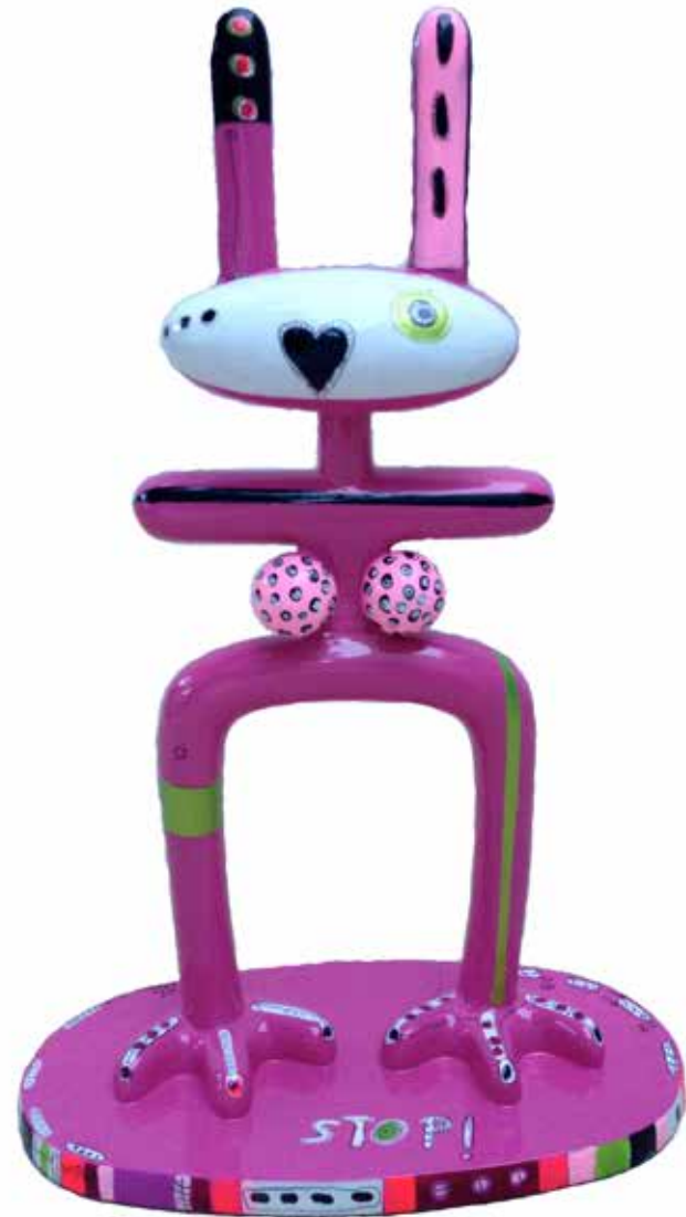
RABBIT, 2014 | 1/1 Resine 100 x 65 x 40 cm