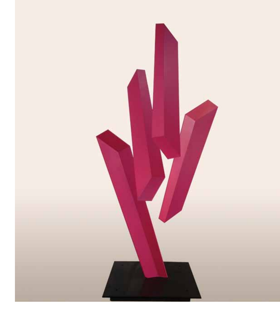
Obtuse Opal Red, Hand Made Lacquered Steel, H 345 x L 170 x W 25 cm, 2013

Barrios' monumental pieces have been installed around the world- in his native Venezuela a total of 15 sculptures grace public spaces; the city of Sunny Isles, FL commissioned a 6 meter structure specifically designed to withstand hurricanes; in Spain, in commemoration of the 500 years of the discovery of the Americas, yet another 8 meter tall piece stands in the port from which Columbus departed. In March of 2012, Barrios was honored by the Fund for Park Avenue to exhibit 9 monumental works along Park Avenue in New York, gracing the avenue for 4 months and gaining international recognition.