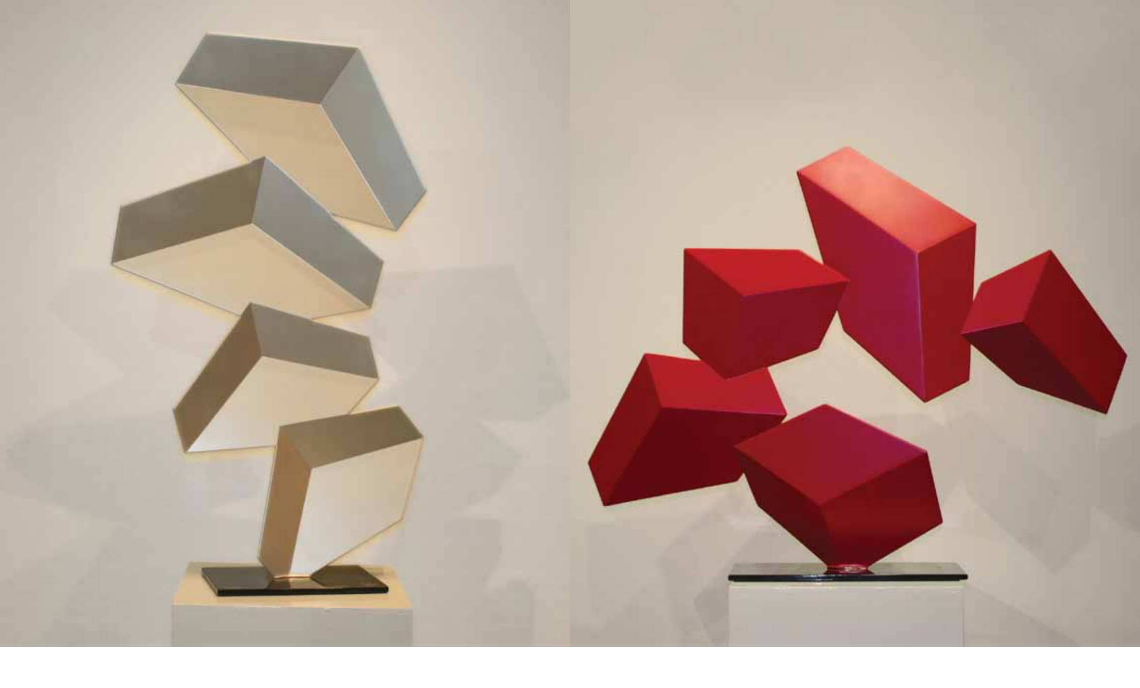
NIMBUS White Pearl, Hand Made Lacquered Steel, H 81 x L 48 x W 7 cm, 2/4, 2013